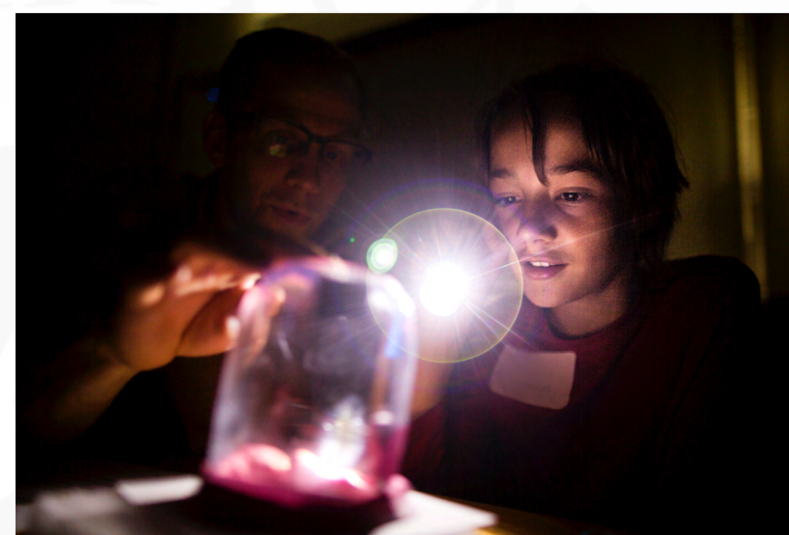
A student testing his hand-made cloud chamber during the "Are You Radioactive?" Workshop