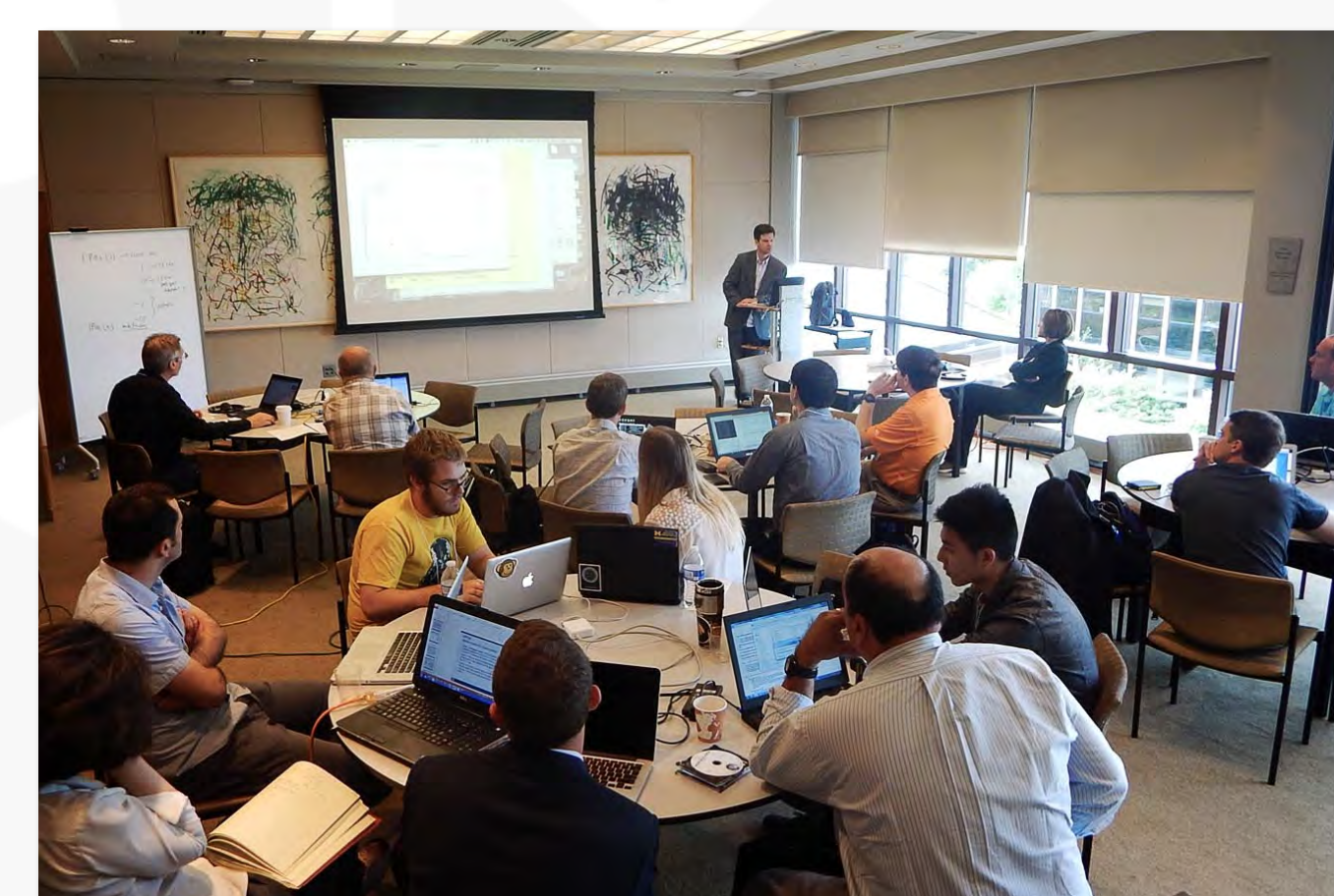
Workshop attendees gain hands-on experience with MCNPX-PoliMi